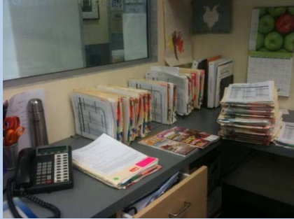
Charts to be seen...