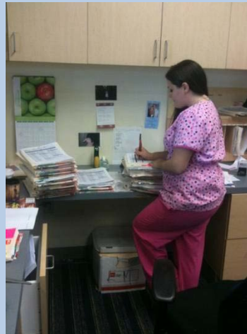
Charts to be made...